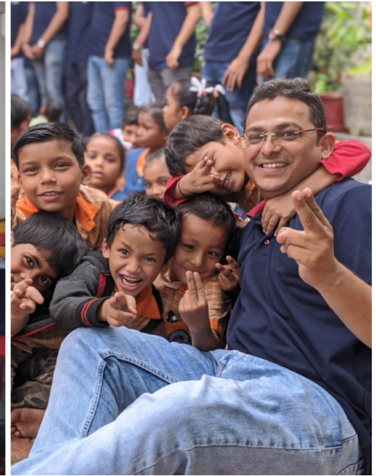
(CSR activity at Government School No. 139, Surat, Gujarat, India)

Because we act responsibly! In the true spirit of bringing cheer, which is really the cornerstone of Christmas celebrations, ISP went out to spread joy amongst underprivileged children. ISP organized a Christmas celebration for the children of Government School in Surat. A team of 100 ISPIans was deputed to different classrooms and the children played the games designed specifically for the purpose of educating them and that motivated self learning and problem solving skills. The little ones of the school were treated with some gifts, delicious goodies and sweets.