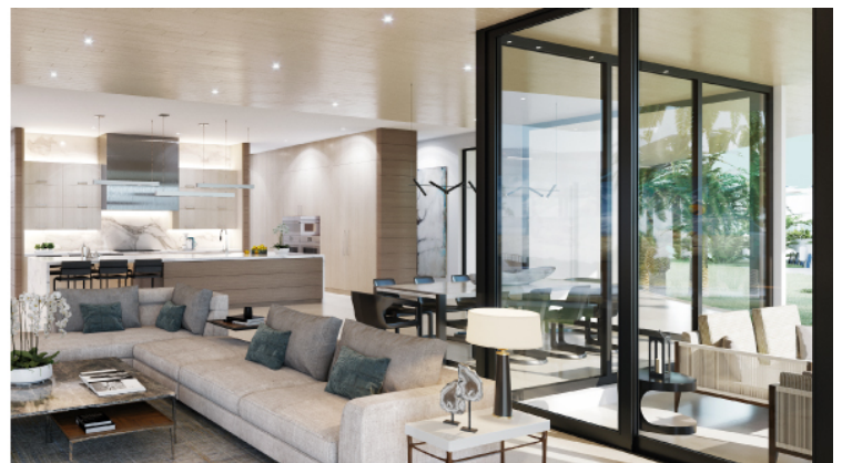
(Location: Florida, USA)