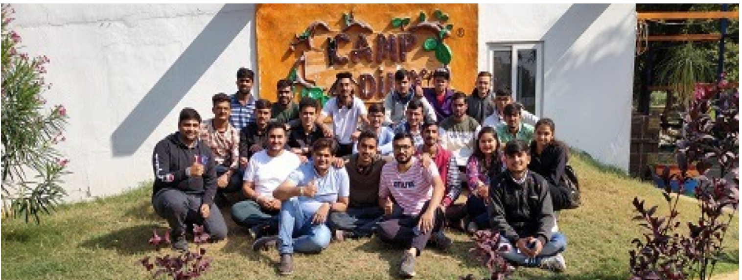
(Location: Camp Dilli, Vadodara, Gujarat, India)

It is an initiative to promote empathy and cooperation in our work culture. This time, the selected employees of the Joybox group, which comprises people, specially nominated by coworkers for their help and work, went to an exotic camping place at 'Camp Dilly'.